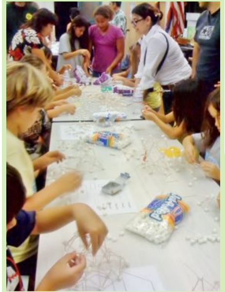
Creating 3 dimensional objects using marshmallows and toothpicks was enjoyed by all!

Both the PTSA and the PCNC were delighted to see so many families at Math & Movie Night last month. What a great way to kick off the Fall Break. Thank you to the Dream Co staff for setting up the tables for the event. A