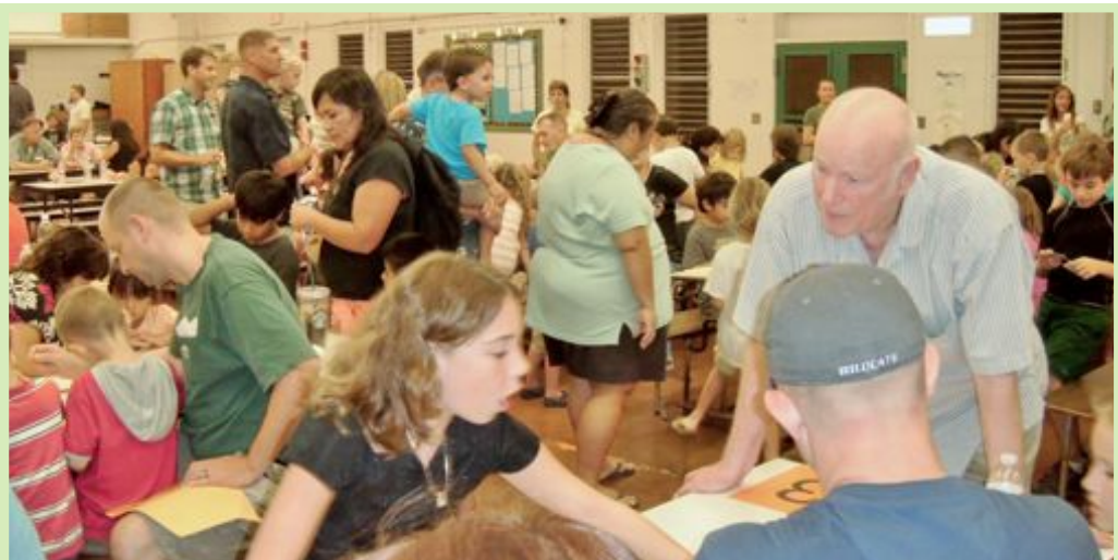
Fun was had by ALL!